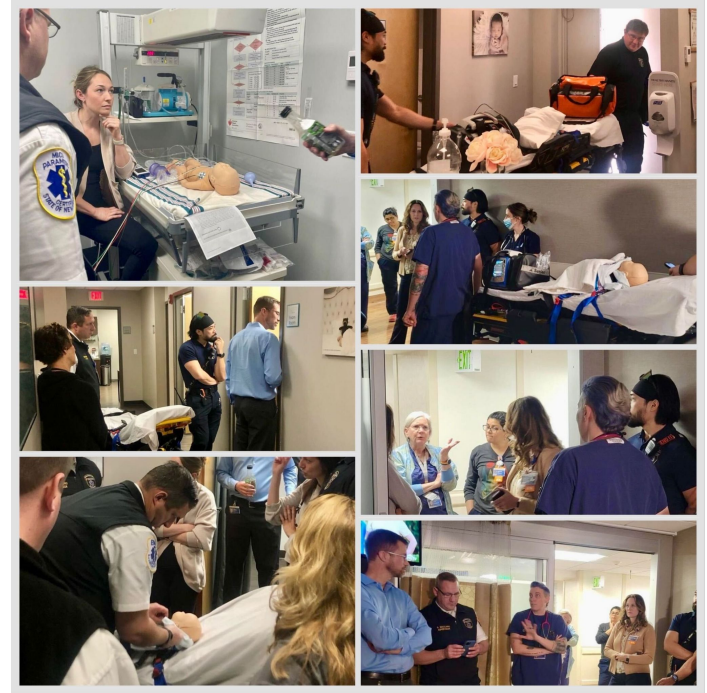
Our Birthing Center / Morristown Medical Center (NJ)