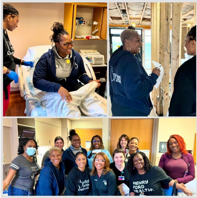
Birth Detroit / Henry Ford Health (MI)