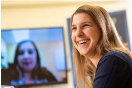
National Learning Library

CHC has curated a series of resources, including webinars to support your health center through education, assistance and training.